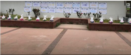
TOHS ASB @TOHS ASB - Apr 4 Dream Week for the special ed class wraps up tomorrow! This week was full of events like scavenger hunts, ASB for a day, and even a field trip with the varsity basketball team tomorrow. It's been an awesome week! @ThousandOaksHS

Being a Lancer means being part of our community.